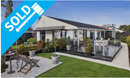
1/132 Leinster Road, MERIVALE $830,000