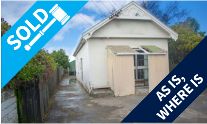
220 Olliviers Road, LINWOOD $149,000