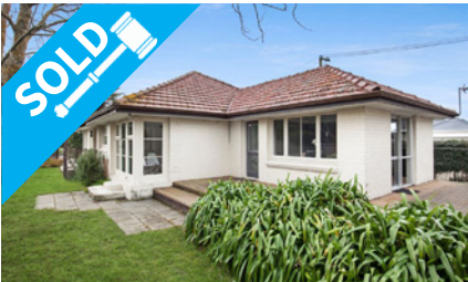
147 Hamilton Avenue, FENDALTON $583,000