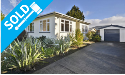
58 Radley Street, WOOLSTON $320,000