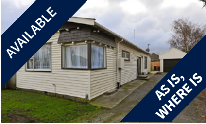
5 Laurence Street, WALTHAM