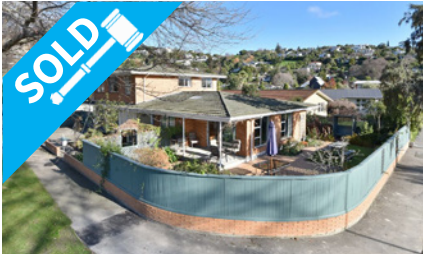
10 Holliss Avenue, CASHMERE $690,000