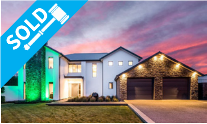
3 + 5 West Green, WAITIKIRI $1,500,000