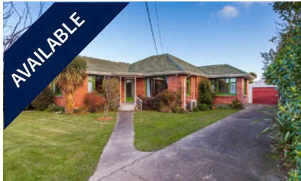
38 Wyn Street, HOON HAY