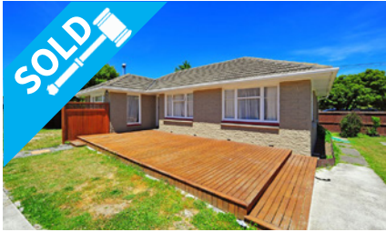
19 Charlcott Street, BURNSIDE $455,000