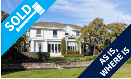
95 Heaton Street, MERIVALE No Price