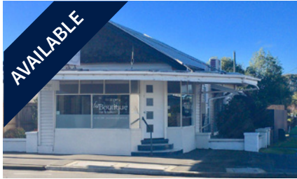
210 Colombo Street, SYDENHAM