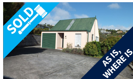
1/146 Soleares Avenue, MT PLEASANT $151,000