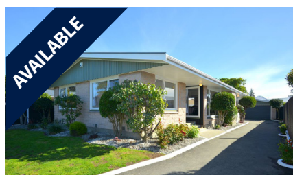
19 Cheyenne Street, UPPER RICCARTON