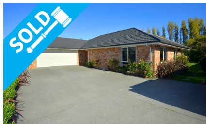
45 Somerville Crescent, AIDANFIELD $628,000