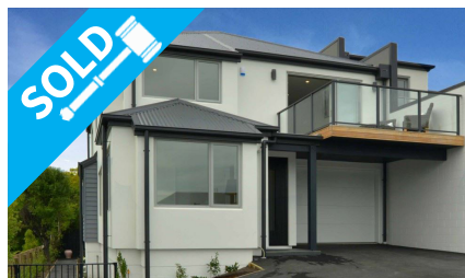
3 Bengal Drive, CASHMERE No Price