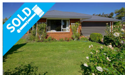
44B Hoon Hay Road, HOON HAY $437,500