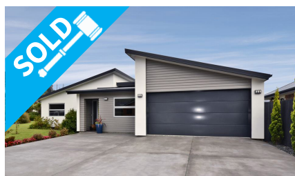
1 Romar Lane, HEATHCOTE $670,000