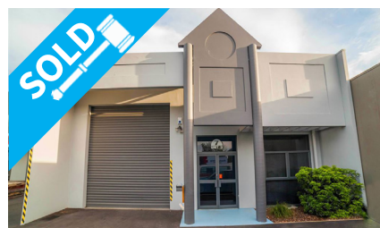
3/7 Homersham Place, BURNSIDE $415,000 +GST