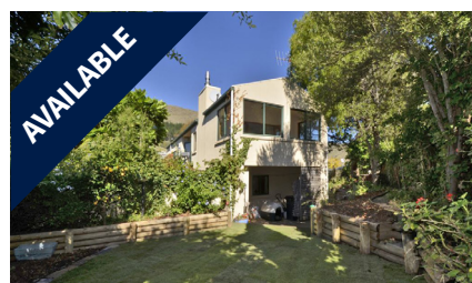
152 Wakefield Avenue, SUMNER