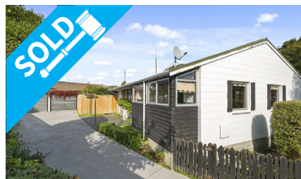
1 Hythe Lane, ST MARTINS $382,000