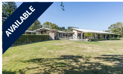
33 Sutherlands Road, HALSWELL