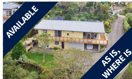
171 Clifton Terrace, CLIFTON