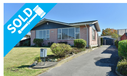
31 Cheyenne Street, UPPER RICCARTON $450,000