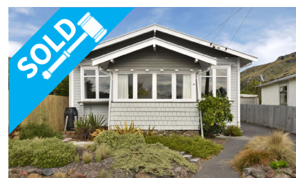
20 Colenso Street, SUMNER $555,000