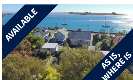
228 Main Road, REDCLIFFS