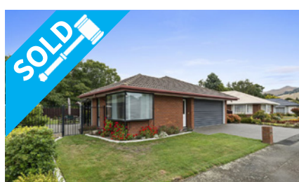
5 Castle Way, BECKENHAM $560,000