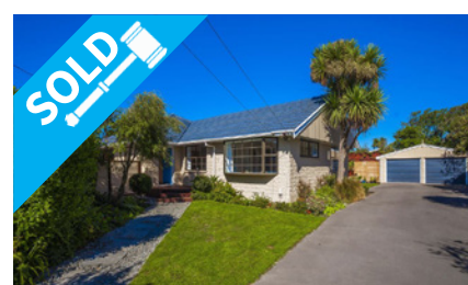
33 Shackleton Street, NEW BRIGHTON $450,000