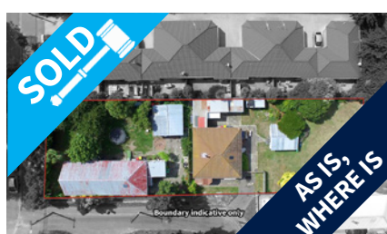
24 Church Square & 80 Poulson Street, ADDINGTON $775,000