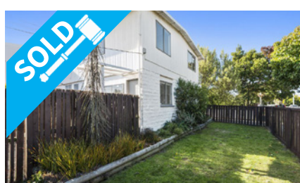
36 Cameron Street, SYDENHAM $261,000