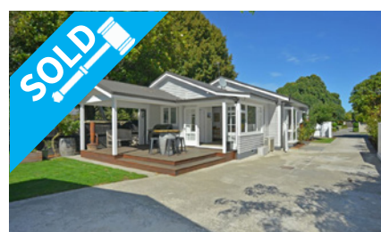
120 Strickland Street, SYDENHAM $536,500