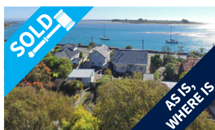
230 Main Road, REDCLIFFS $650,000