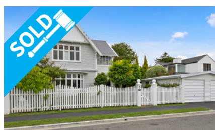
5 Queens Avenue, FENDALTON $1,735,000