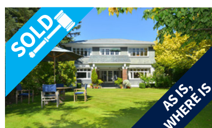
44 Greens Road, FENDALTON $747,000