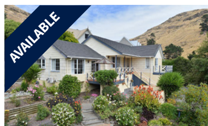
27 Cascade Place, SUMNER