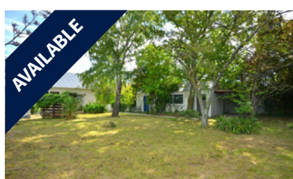
106 Picton Avenue, RICCARTON