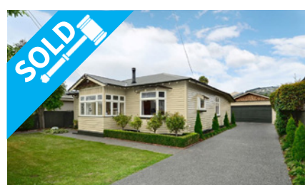
34 Malcolm Avenue, BECKENHAM $721,000