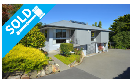
74A Hackthorne Road, CASHMERE $652,000