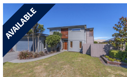
33 McMahon Drive, AIDANFIELD