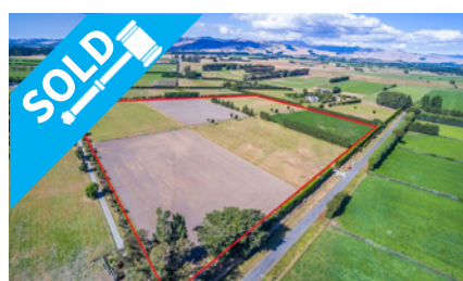
36 Andrews Road, GREENPARK $601,000 + GST