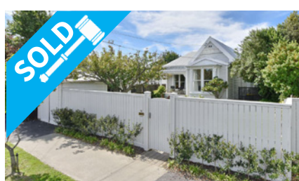
98 Forfar Street, ST ALBANS $625,000