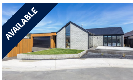
3 Robb Place, KAIAPOI