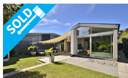
12 Augusta Street, REDCLIFFS $860,000