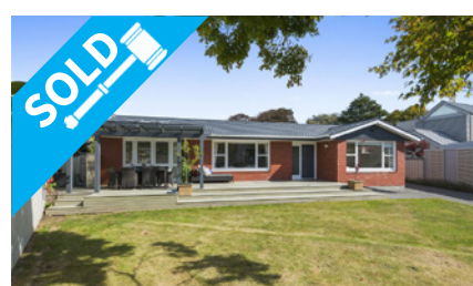
8 Totara Street, FENDALTON $888,000