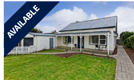
16 Cleland Street, BELFAST