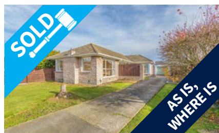
24 Rydal Street, HOON HAY $264,000