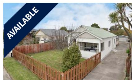
38 Wyon Street, LINWOOD