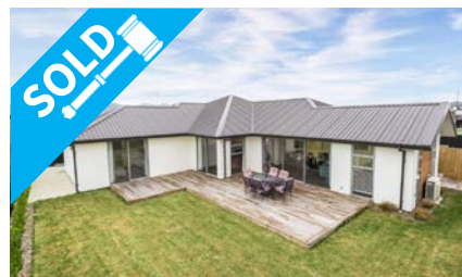
136 Kittyhawk Avenue, WIGRAM $715,000