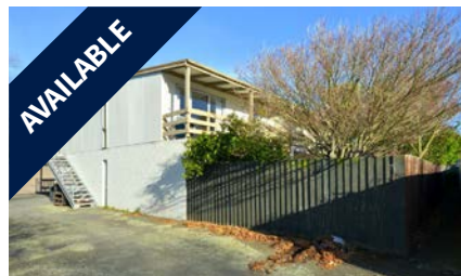
4/273 Riccarton Road, RICCARTON