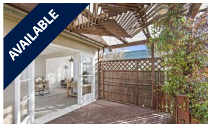
32 Hoani Street, PAPANUI