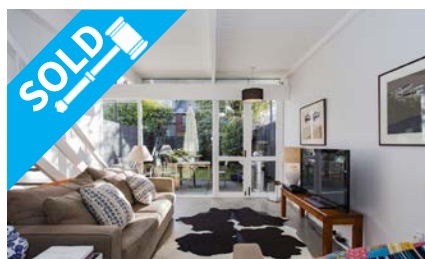
3/43 Fendalton Road, FENDALTON $452,000