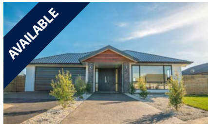
17 Edwin Ebbett Place, WIGRAM