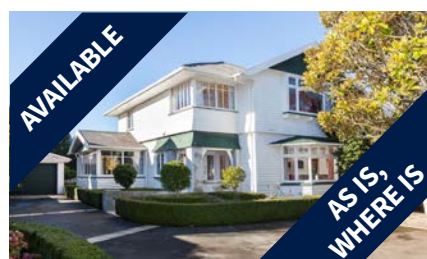
21 St Andrews Square, MERIVALE