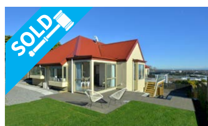
33 Cannon Hill Crescent, MT PLEASANT $830,000