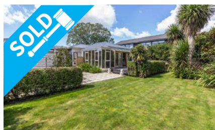
23 Devonport Lane, MERIVALE $735,000