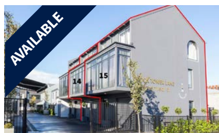
14/388 Montreal Street, CHCH CENTRAL