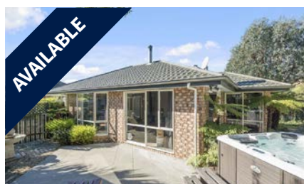
49A Cobra Street, HALSWELL