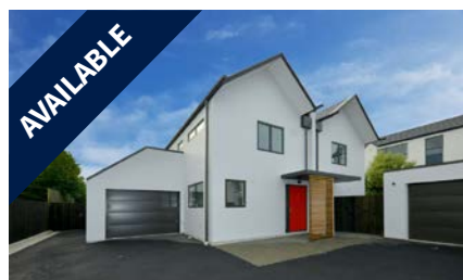
239E Salisbury Street, CHCH CENTRAL