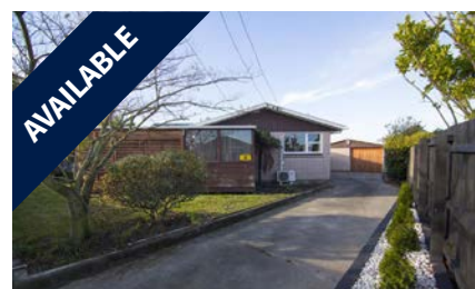
6 Fenchurch Street, NORTHCOTE