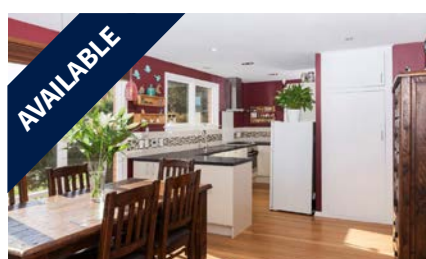
55 Barrowclough Street, HOON HAY