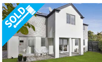
16B Kotare Street, FENDALTON $855,000