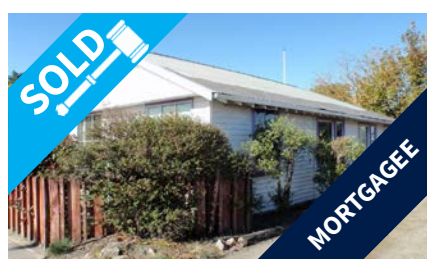
31 Main Street, OXFORD $320,000