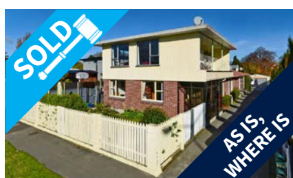
33A Fendalton Road, FENDALTON $835,000