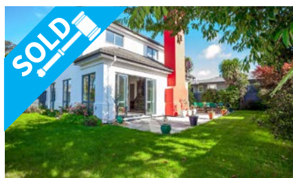
83 Greers Road, BURNSIDE $660,000