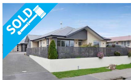
61C Oram Street, NEW BRIGHTON $450,000