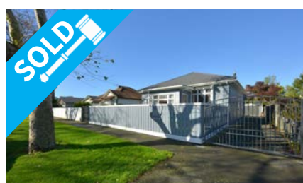
94 Roker Street, SOMERFIELD $578,000