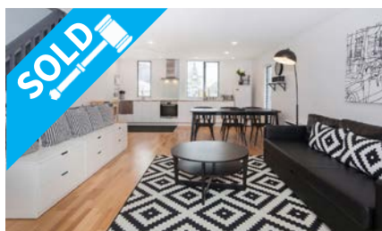
15/388 Montreal Street, CHCH CENTRAL $470,000 +GST