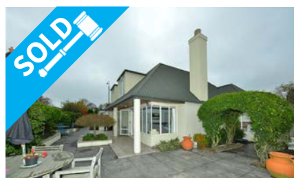
95 Clyde Road, ILAM $695,000