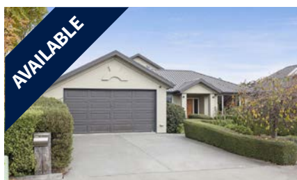
4 Tullamore Place, CASEBROOK