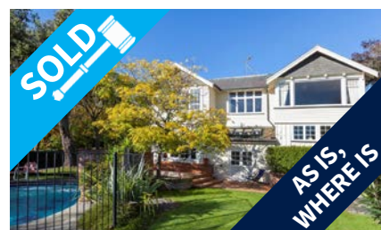
4 Gwynfa Avenue, CASHMERE $725,000