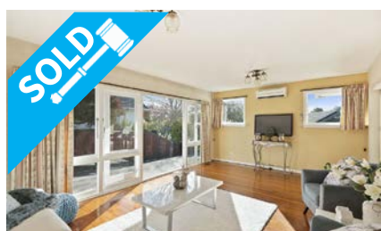
9 Doncaster Street, UPPER RICcarton $470,000