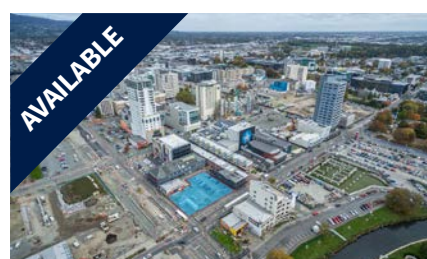
182-196 Armagh Street, CHCH CENTRAL