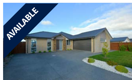
11 Coull Street, WIGRAM