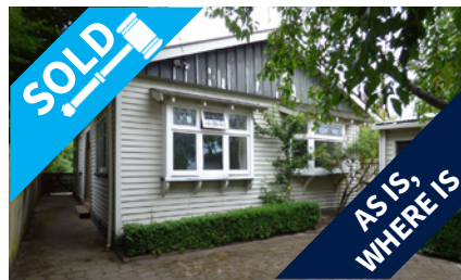
128 Stapletons Road, RICHMOND $250,000