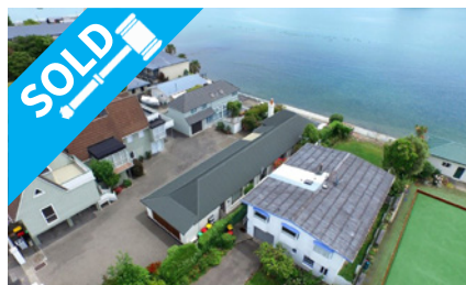
48 Rue Jolie, AKAROA $1,150,000