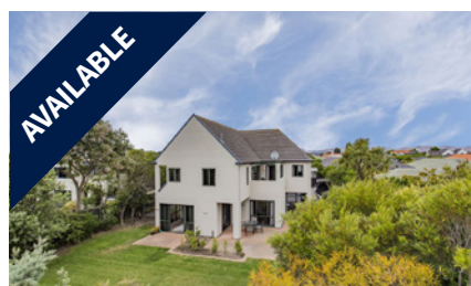
20 Orlando Crescent, WAIMAIRI BEACH