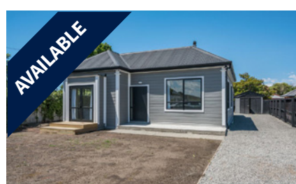
22 Bordesley Street, PHILLIPSTOWN