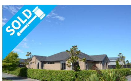
35 Sioux Avenue, WIGRAM $688,500