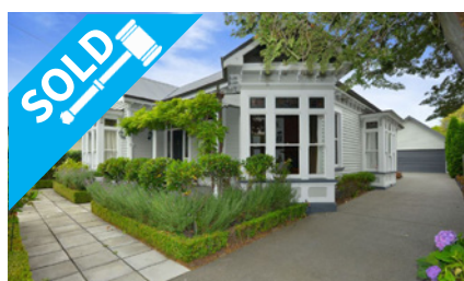
30 Office Road, MERIVALE $1,385,000