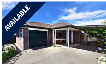
54a Dacre Street, LINWOOD