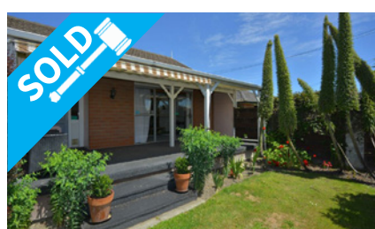
33 Belfast Road, BELFAST $318,000