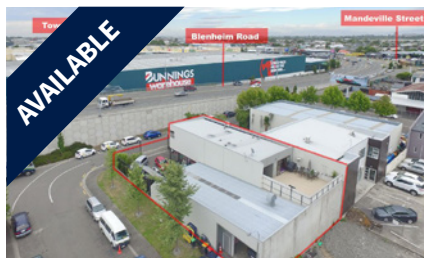
12a & 12b Lowe Street, ADDINGTON