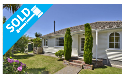
11 Thorpe Street, SUMNER $670,000