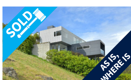
16 Highview Lane, SCARBOROUGH $581,000