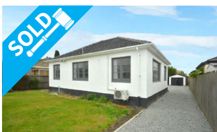
14 Amyes Road, HORNBURY $390,000