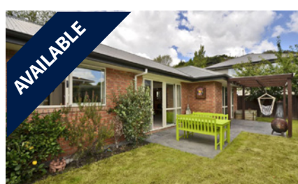
62 Ngaio Street, ST MARTINS