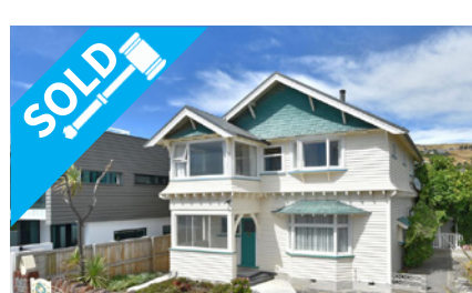
28 Esplanade, SUMNER $1,450,000