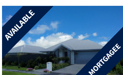
29 Elba Crescent, HALSWELL