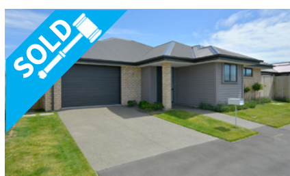
14 Denali Street, HALSWELL $532,500