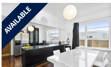
108 Randolph Street, WOOLSTON