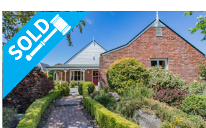
22 Holderness Place, ILAM $825,000