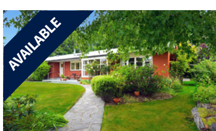
14 Hanrahan Street, ILAM