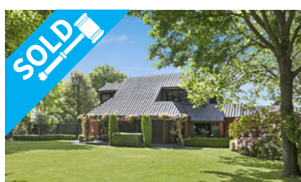
323a Withells Road, AVONHEAD $1,300,000