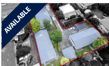
101 Southampton Street, SYDENHAM