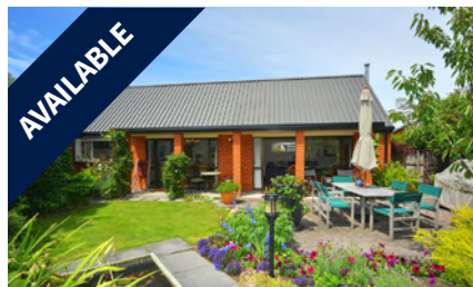
7 Tripp Place, ILAM