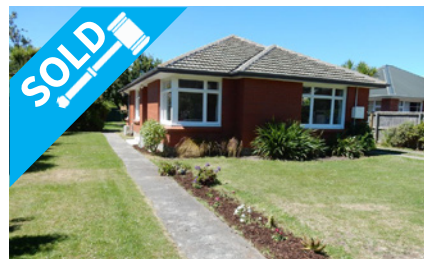
60 Celia Street, REDCLIFFS $561,000