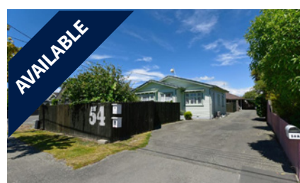
54 Dacre Street, LINWOOD