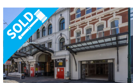
121 Worcester Street, CHCH CENTRAL $756,000