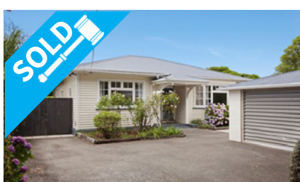
42 Hinemoa Street, SPREYDON $520,000