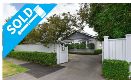
33 Perry Street, PAPANUI $806,000