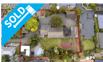
105 Burwood Road, BURWOOD $850,000