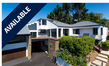
50 Whareora Terrace, CASHMERE