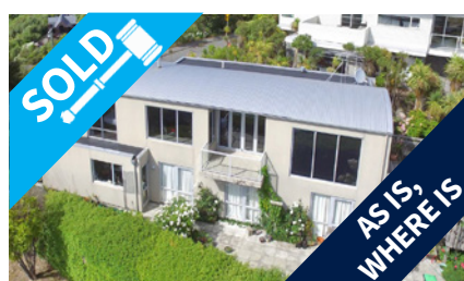
106a Mt Pleasant Road, MT PLEASANT $490,000