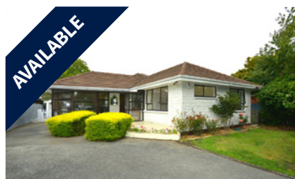
132 Avonhead Road, AVONHEAD