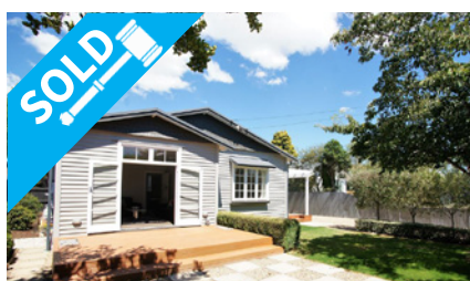
88 McFaddens Road, ST ALBANS $572,000