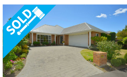
5 Wardour Mews, AVONHEAD $805,000