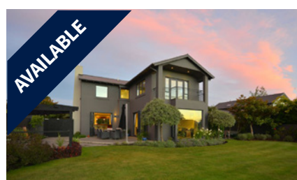
85 Waitikiri Drive, WAITIKIRI