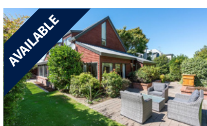
27 Glenharrow Avenue, AVONHEAD