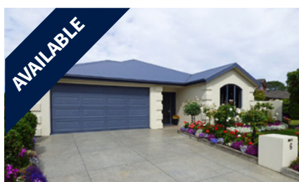
6 Becmead Drive, HAREWOOD