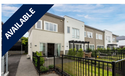
3/7 Bangor Street, CHCH CENTRAL