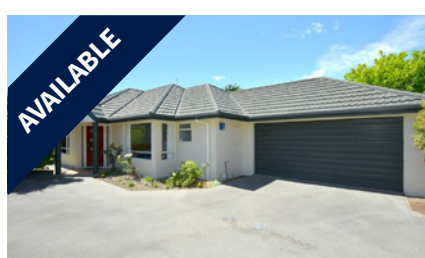
420a Memorial Avenue, BURNSIDE