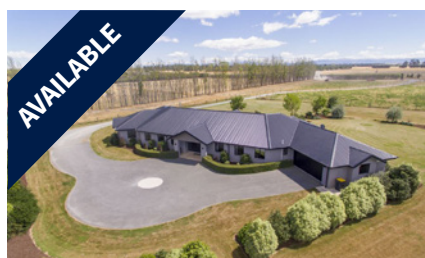
1 Maddisons Road, TEMPLETON