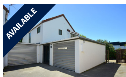
5/138 Waimairi Road, ILAM