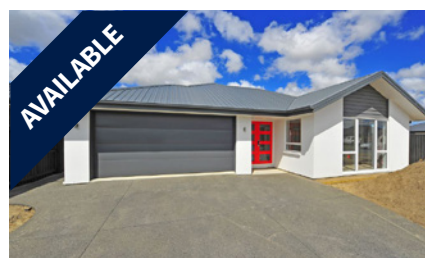
5 Nacelle Road, WIGRAM