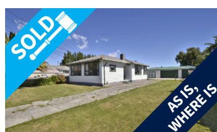
35 St Johns Street, WOOLSTON $220,200