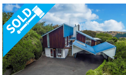
134 Dyers Pass Road, CASHMERE HILLS $830,000