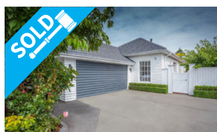
399 Withells Road, AVONHEAD $562,000