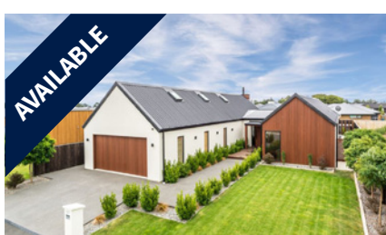
107 Shillingford Boulevard, ROLLESTON