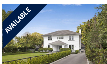
144 Glandovey Road, FENDALTON