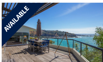
22 Whitewash Head Road, SUMNER