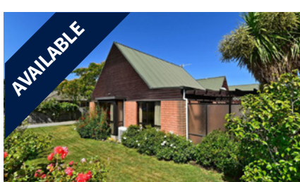
1/5 Bowen Street, UPPER RICcarton