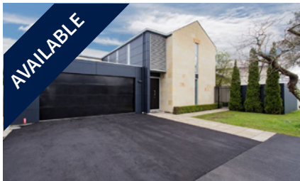
31D Wairarapa Terrace, FENDALTON