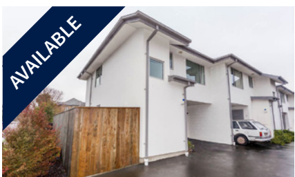
1/424 Manchester Street, ST ALBANS