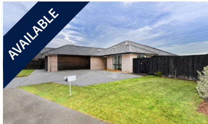
36 Sioux Avenue, WIGRAM