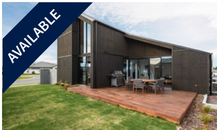
70 Ledbury Drive, ROLLESTON