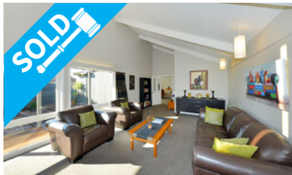
14 Kent Lodge Avenue, AVONHEAD $720,000