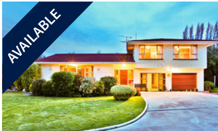
716 Christchurch Akaroa Road, TAI TAPU