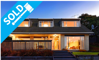
70 Landsdowne Terrace, CASHMERE $600,000