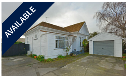
1/72 Elizabeth Street, RICCARTON