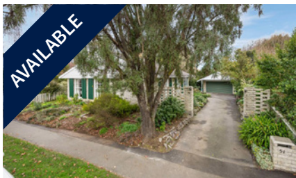
51 Parkstone Avenue, ILAM