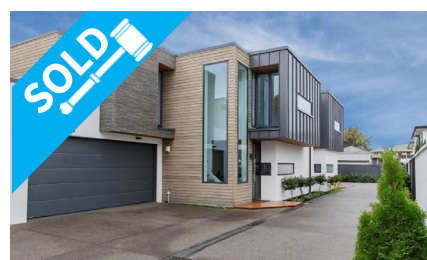
2/40 Rhodes Street, MERIVALE $1,190,000