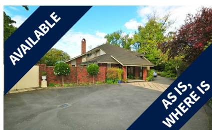
26A Glandovey Road, FENDALTON