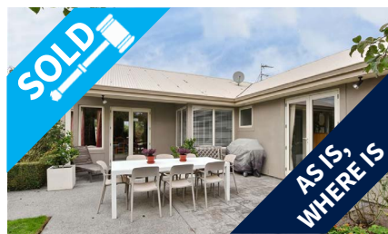
3 Kestrel Place, FERRYMEAD $273,000