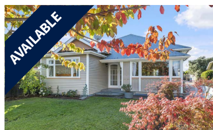
31 Hendon Street, ST ALBANS