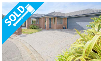
3 Piper Lane, BECKENHAM $581,000