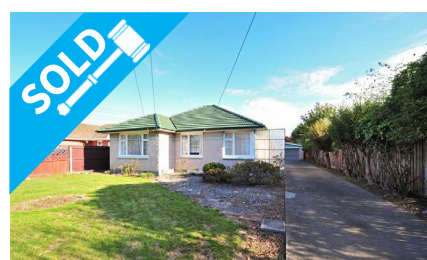
37 Appleby Crescent, BURNSIDE $422,000