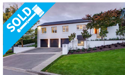
41 Bengal Drive, CASHMERE $1,780,000