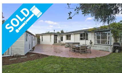
7 Farndale Place, AVONHEAD $630,000