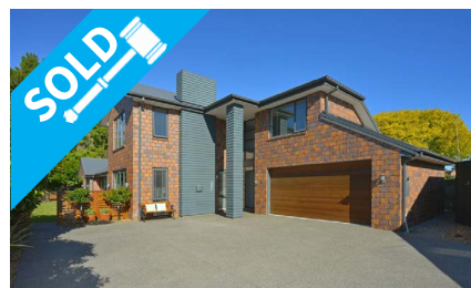
60 Waitikiri Drive, WAITIKIRI $648,000