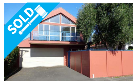
12 Moa Place, CHRISTCHURCH CENTRAL No Price