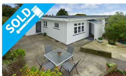
21 Aotea Terrace, HUNTSBURY $565,000