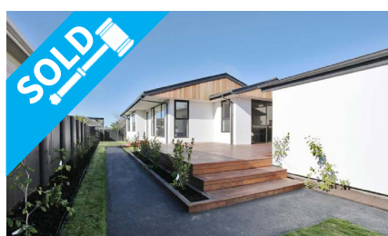
7 Tonks Street, NORTH NEW BRIGHTON $400,000