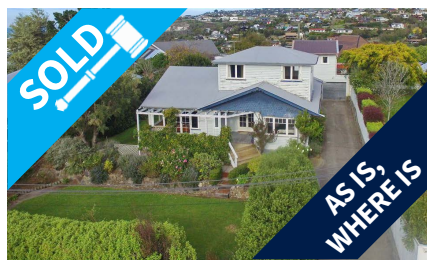
87 St Andrews Hill Road, MT PLEASANT $455,500