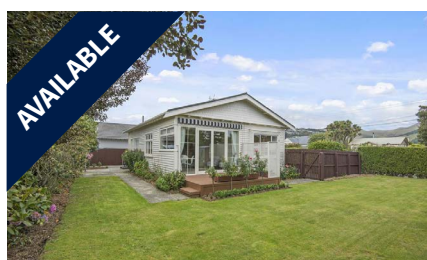
9 Martin Avenue, BECKENHAM