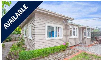
51 St James Avenue, PAPANUI