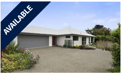
14a Claxton Place, ST MARTINS