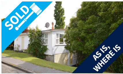
4 Armstrong Crescent, AKAROA $250,000