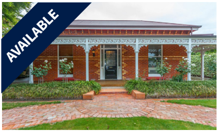
277 Fitzgerald Avenue, CHCH CENTRAL