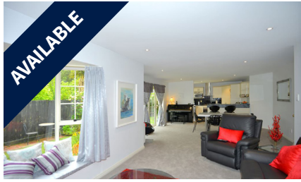
196a Avonhead Road, AVONHEAD