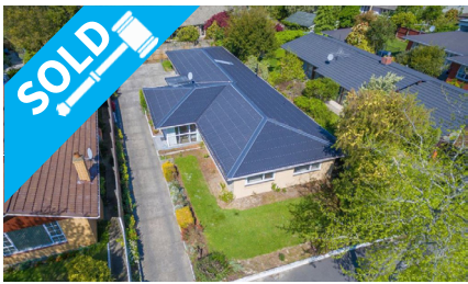
31 Lynfield Avenue, ILAM $810,000