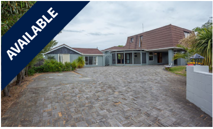
1/60 Cresswell Street, BURWOOD