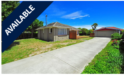
19 Charlcott Street, BURNSIDE