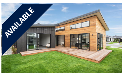
11 Weruweru Street, MARSHLAND