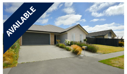
92 Mustang Drive, WIGRAM