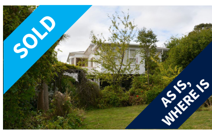
161 & 161A Hackthorn Road, CASHMERE No Price