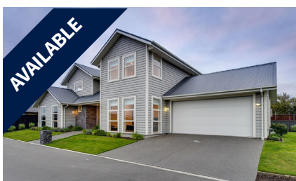
16 Bargrove Close, HALSWELL