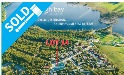
Lot 14 Iveagh Bay Drive, LAKE BRUNNER $70,000