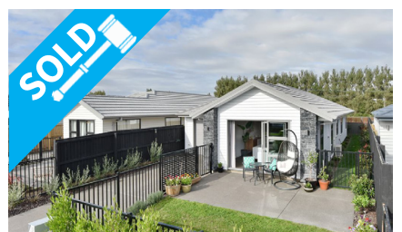
57 Packard Crescent, HALSWELL $457,000