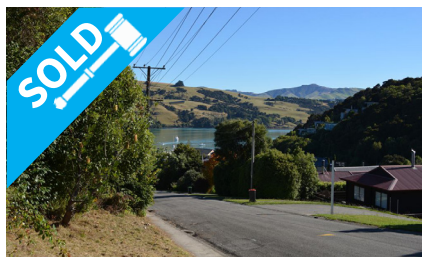
20 Selwyn Avenue, AKAROA $390,000