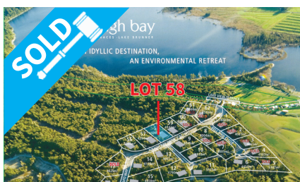
Lot 58 Iveagh Bay Drive, LAKE BRUNNER $65,000