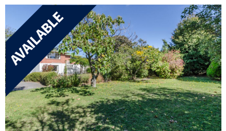
55A Opawa Road, WALTHAM