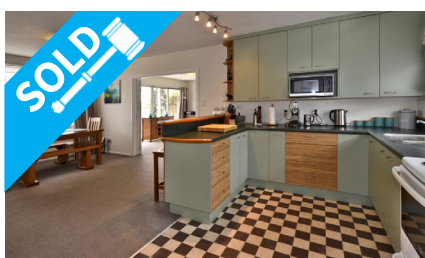
129 Briggs Road, SHIRLEY $380,000