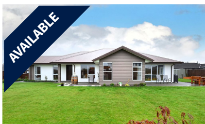
93 Cairnbrae Drive, PREBBLETON