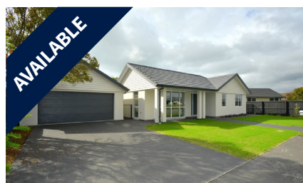
450 Bower Avenue, PARKLANDS