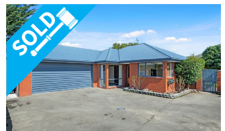
9A Finsbury Street, HORNBY $380,000