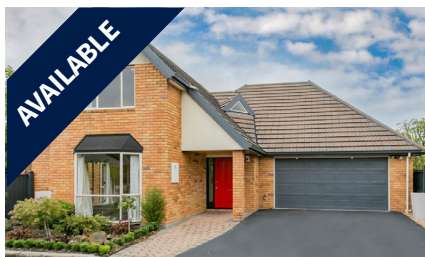
51A Memorial Avenue, FENDALTON