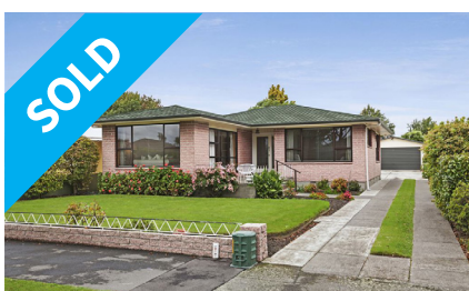
6 Lochee Road, UPPER RICCARTON No Price