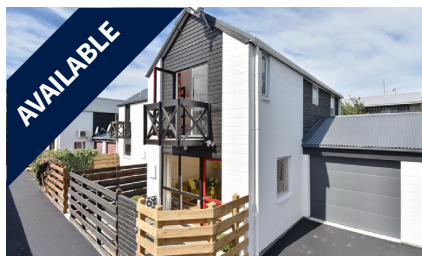
28B Albany Street, MERIVALE