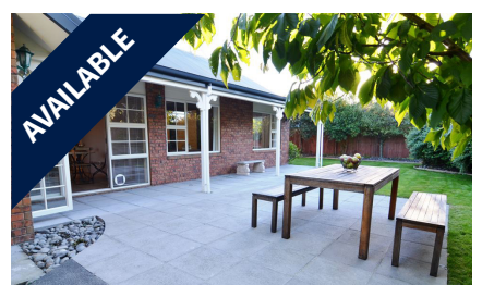
14 Ti Rakau Drive, FERRYMEAD