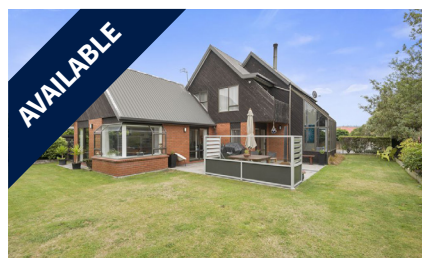
9 Forest Park Place, PARKLANDS