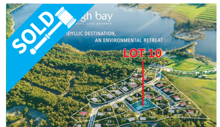
Lot 10 Iveagh Bay Drive, LAKE BRUNNER $70,000