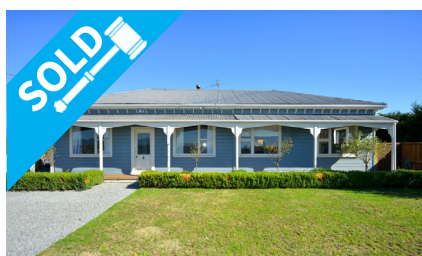
357 Pound Road, YALDHURST $450,000