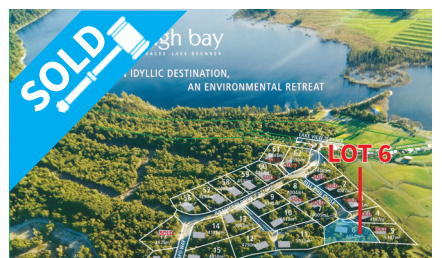
Lot 6 Bellbird Close, LAKE BRUNNER $59,000