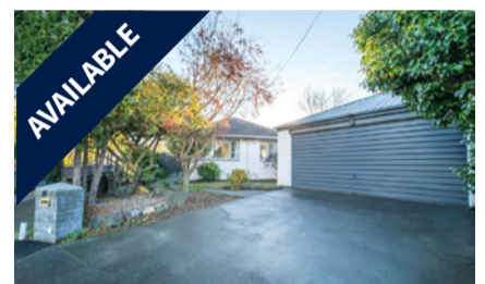
10 Kyeburn Place, AVONHEAD