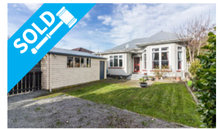
13 Mathers Road, HOON HAY $375,000