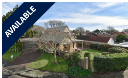
2 Tuscany Place, BECKENHAM