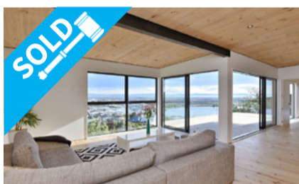
305 Cannon Hill Crescent, MT PLEASANT $869,000