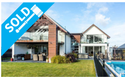
56 Bluestone Drive, WAITIKIRI $1,310,000