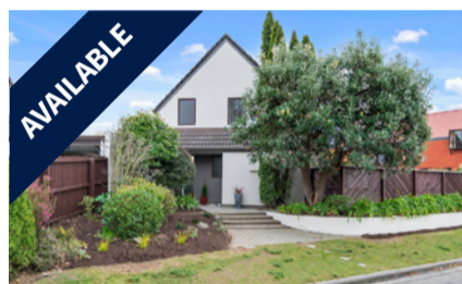
1/3 Tekapo Place, OPAWA