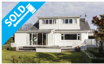
47 Hamilton Avenue, FENDALTON $995,000