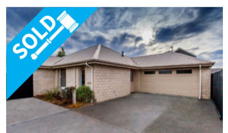
446 Madras Street, ST ALBANS $555,000