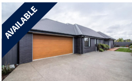
10 Chedworth Court, ROLLESTON