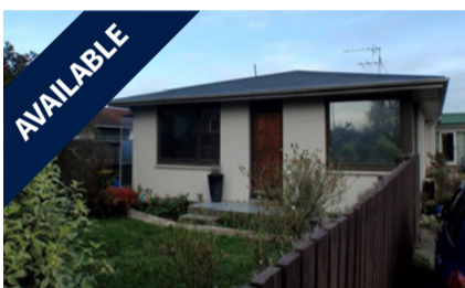
73A Percival Street, RANGIORA