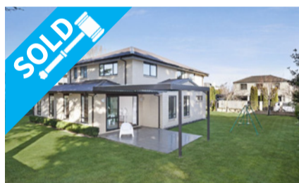
5 Hogarth Lane, BURNSIDE $1,415,000