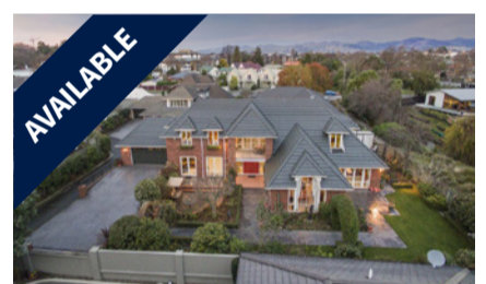
22 Ilam Park Place, ILAM