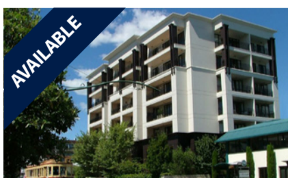
3G & 6F/66 Armagh Street, CHCH CENTRAL