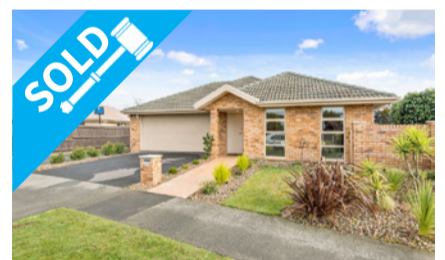
37 Country Palms Drive, HALSWELL $513,000