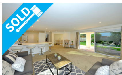
11 Cottessmore Close, BURNSIDE $940,000