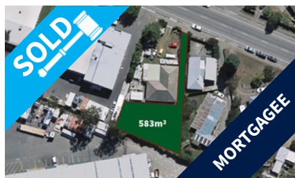
23A Buchanans Road, SOCKBURN $160,000