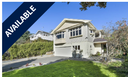
10 Valley Road, CASHMERE