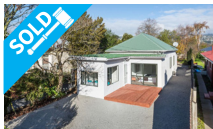
46 Southey Street, SYDENHAM $395,000