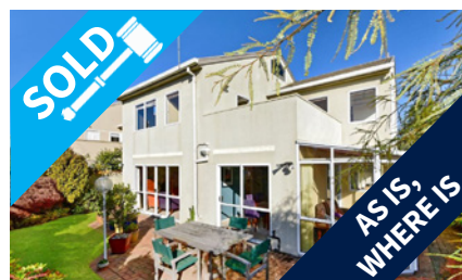
65C Rugby Street, MERIVALE $532,000