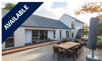
6 Edward Street, PREBBLETON