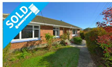
34 Rue Balguerrie, AKAROA $450,500