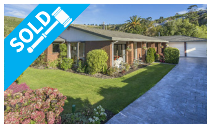
7 Bishopsworth Street, HILLSBOROUGH $575,000