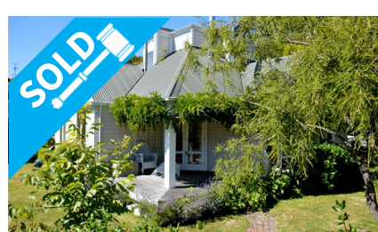
36 Penlington Place, AKAROA $765,000