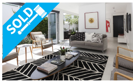
2/69 Derby Street, MERIVALE $840,000