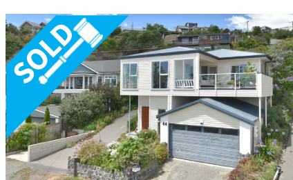
44 Main Road, MT PLEASANT $950,000