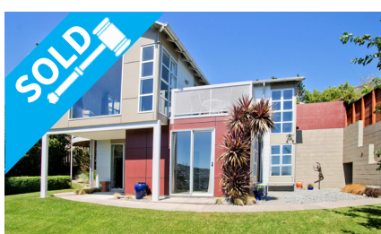
3a Stoddart Lane, CASHMERE $680,000