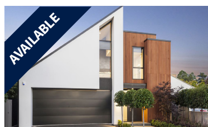
44a Gleneagles Terrace, FENDALTON