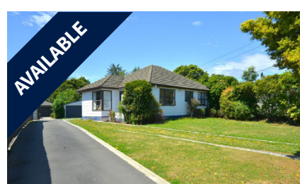
12 Bellbrook Crescent, SHIRLEY