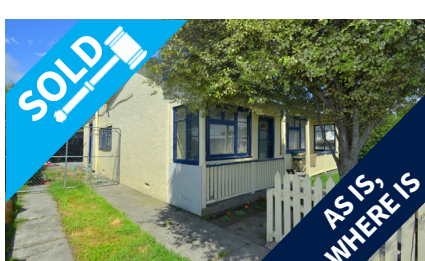
40 Hargest Crescent, SYDENHAM $200,000