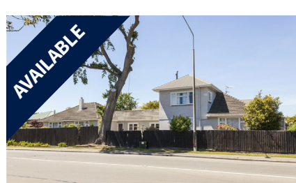
90 Browns & Innes Road, MERIVALE