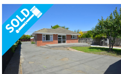
4 Glencoe Street, BURNSIDE $412,000