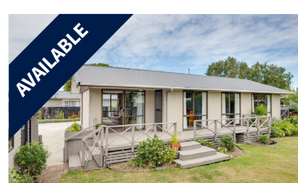
65 Malabar Crescent, HEI HEI