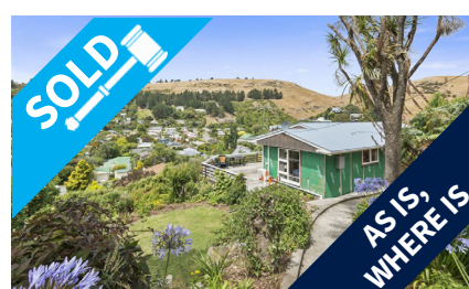
5 Glenview Terrace, ST MARTINS $350,000