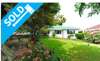
463 Main South Road, HORNBY $520,000