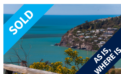
165 Clifton Terrace, SUMNER $253,000