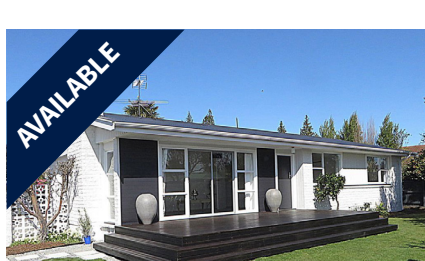
18 Yardley Street, AVONHEAD