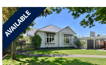
578 Barbadoes Street, ST ALBANS