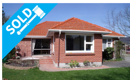
42 Clyde Road, FENDALTON $637,000