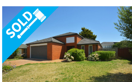
22 Harvard Avenue, WIGRAM $498,000