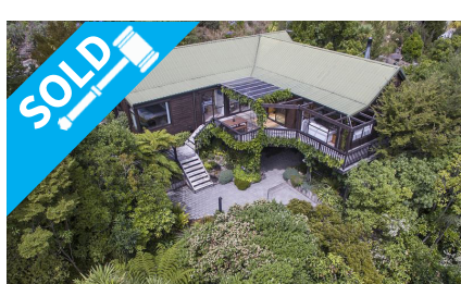
48 Major Aitken Drive, HUNTSBURY $730,000