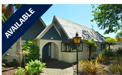
207 Clyde Road, FENDALTON