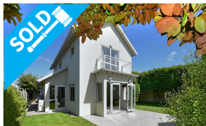
203 Innes Road, ST ALBANS $610,000