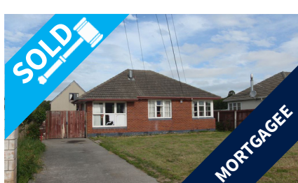
104 Warden Street, RICHMOND $170,000