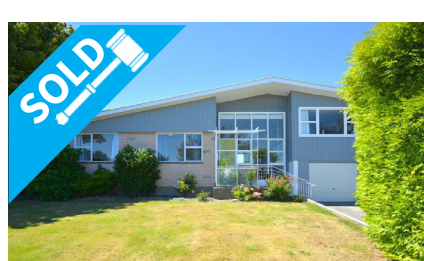
47 Toorak Avenue, AVONHEAD $555,000