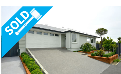
55 Briarmont Street, AVONDALE $521,000