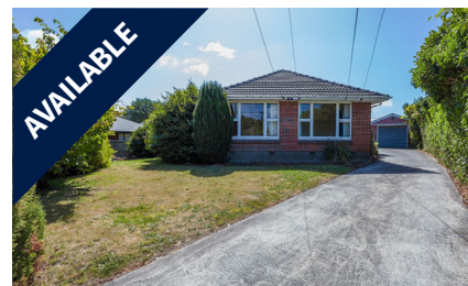
3 Stanbury Avenue, SOMERFIELD