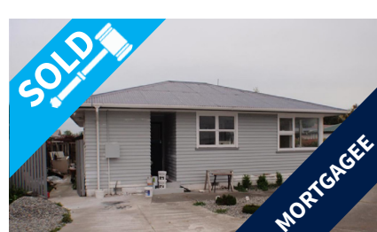
31 Otaki Street, KAIAPOI $250,000