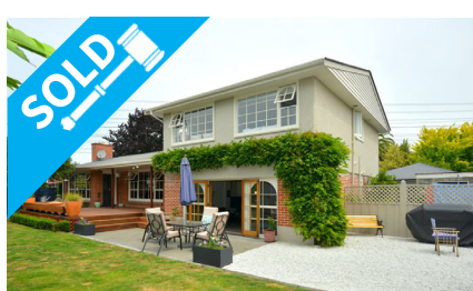
15 Ilfracombe Place, BURNSIDE $660,000