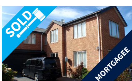
135a Memorial Avenue, BURNSIDE $786,000