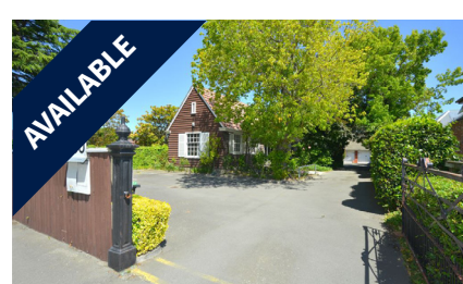
193 Memorial Avenue, BURNSIDE