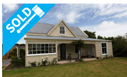
280 Cashmere Road, WESTMORLAND $440,000