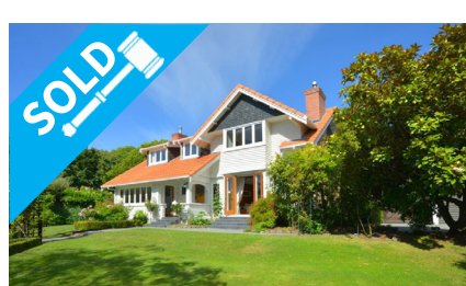
34 Ford Road, OPAWA No Price