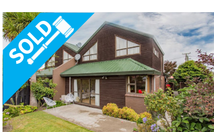
4b Spurway Place, SHIRLEY $354,000