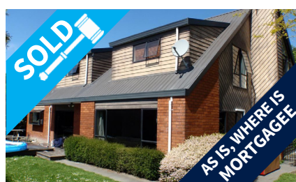
1a Moran Lane, DALLINGTON $250,000