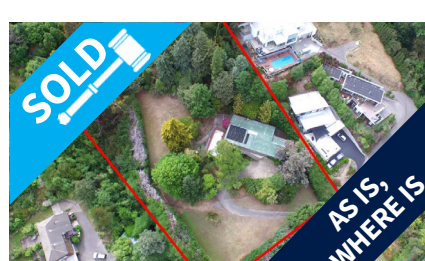
59 Bowenvale Avenue, CASHMERE $550,000