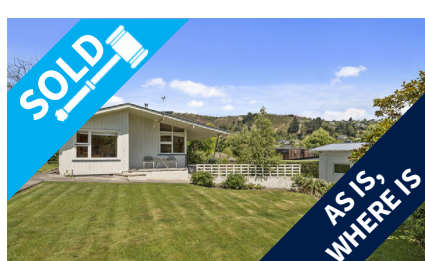
25b Bowenvale Avenue, CASHMERE $390,000