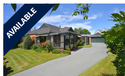
12 Swithland Place, AVONHEAD