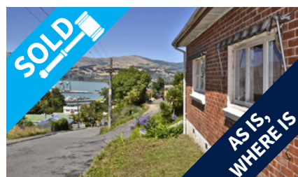
47 Hawkhurst Road, LYTTELTON $150,000