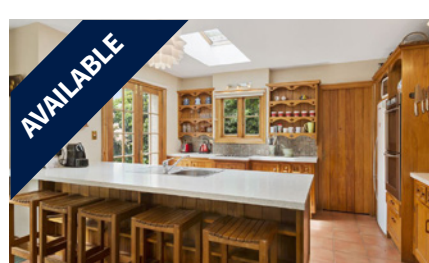
6 Denley Gardens, AVONHEAD