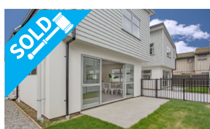
2/33 Elizabeth Street, RICCARTON $540,000