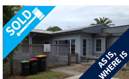
57 Bridge Street, NEW BRIGHTON $215,000