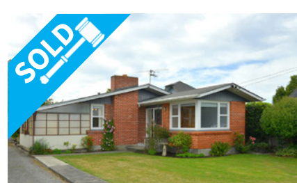
2 Oakdale Street, AVONHEAD $502,000