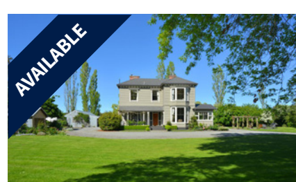
56 Watsons Road, LEESTON