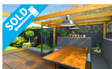
3/218 Springfield Road, MERIVALE $567,000