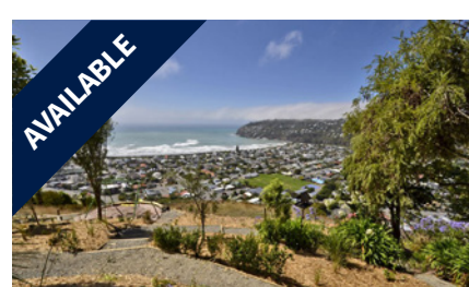
3 Cecil Wood Way, SUMNER