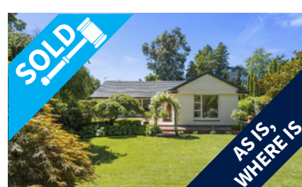
23 Leinster Road, MERIVALE $1,119,000