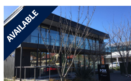
195 Peterborough Street, CHCH CENTRAL