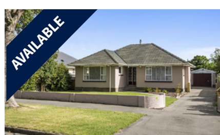
30 Leistrella Road, HOON HAY