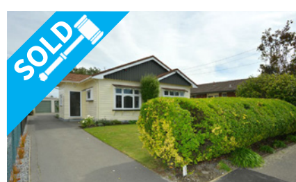
15 Speight Street, ST ALBANS $520,000