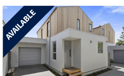
474A Manchester Street, ST ALBANS