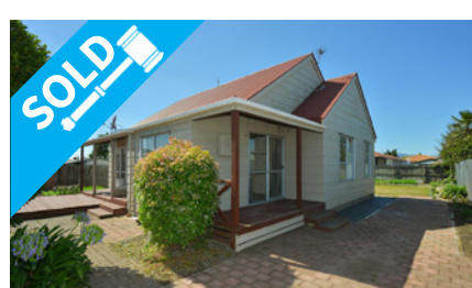
36 Trevor Street, HORNBY $403,000