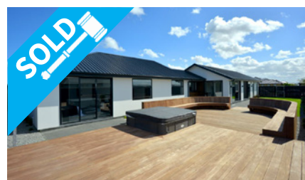
10 Colt Place, WIGRAM $863,500