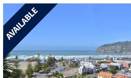
4 Aranoni Track, SUMNER