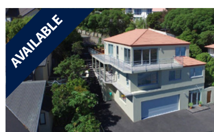
1/13 Vista Place, HUNTSBURY