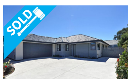
431c Mairehau Road, PARKLANDS $530,000