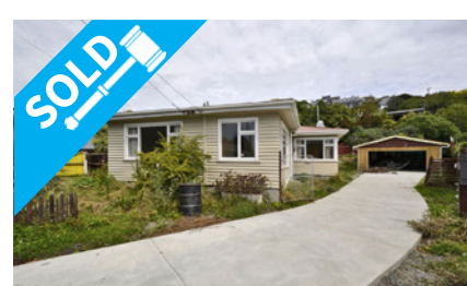
27 Bishopsworth Street, HILLSBOROUGH $313,000