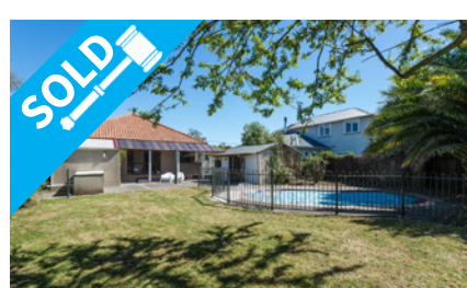
30 Hamilton Avenue, FENDALTON $845,000