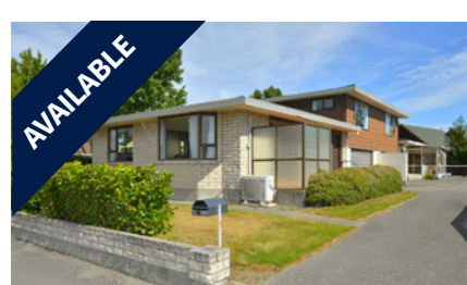
55 Ambleside Drive, BURNSIDE