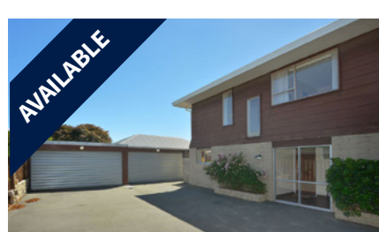
2/8A Rachel Place, AVONHEAD