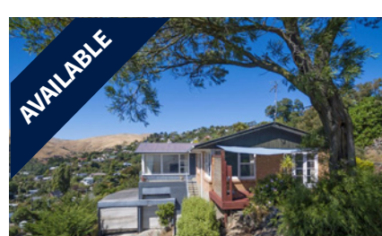
51 Ramahana Road, HUNTSBURY