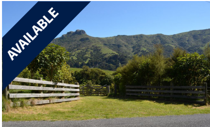
371 Le Bons Bay Road, LE BONS BAY