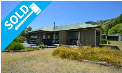
14a Rue de la Mar, LE BONS BAY $585,000