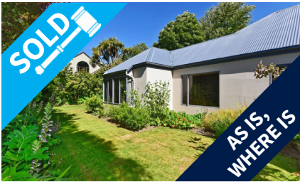
9 Karen Lane, BECKENHAM $506,000