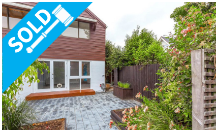
2/71 Office Road, MERIVALE $501,000