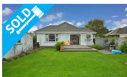
389 Wairakei Road, BURNSIDE $472,000