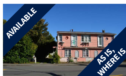
12, 14 & 16 Rue Lavaud, AKAROA