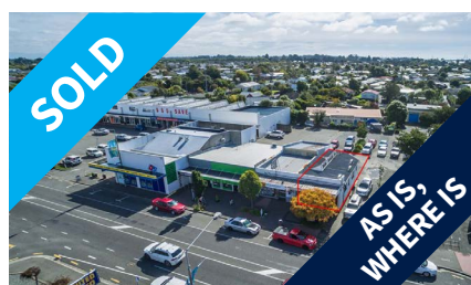
687 Ferry Road, WOOLSTON No Price