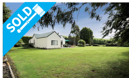
500 Coutts Island Road, BELFAST $675,000