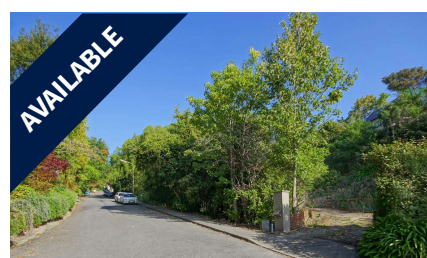
42B Valley Road, CASHMERE