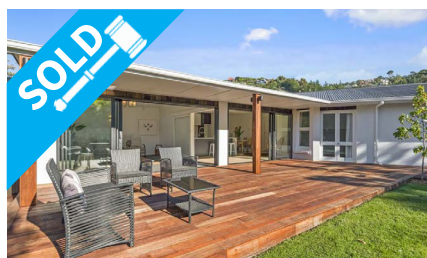
10 Kanuku Place, CASHMERE $770,000