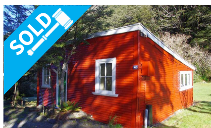
100 Arthurs Pass Road, ARTHURS PASS $100,000