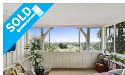
7 Merlewood Avenue, CASHMERE $610,000