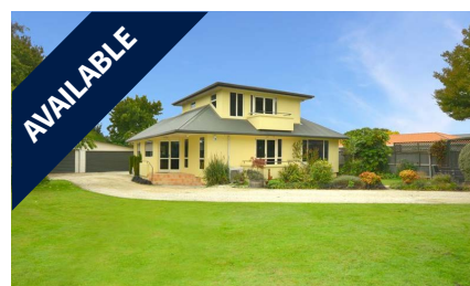
200A Racecourse Road, UPPER RICCARTON