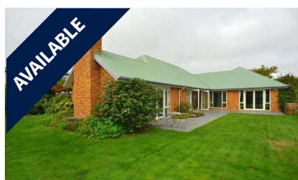
12 Chesterfield Mews, AVONHEAD