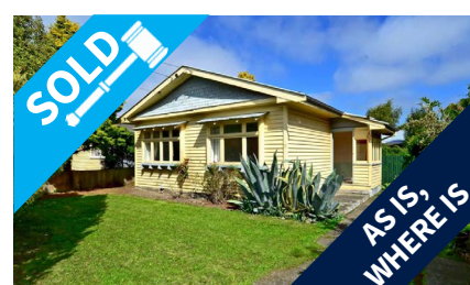
1/35 Carnarvon Street, AVONSIDE $140,000