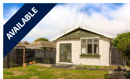
13 Cygnet Street, NORTH NEW BRIGHTON