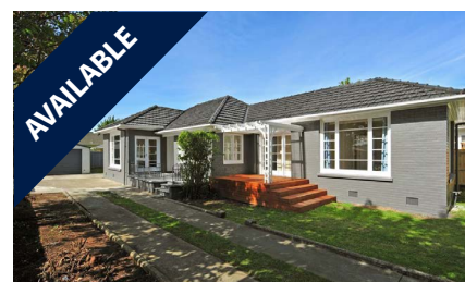
57 Centennial Avenue, RICCARTON