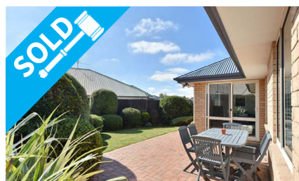
141A Blighs Road, STROWAN $595,000