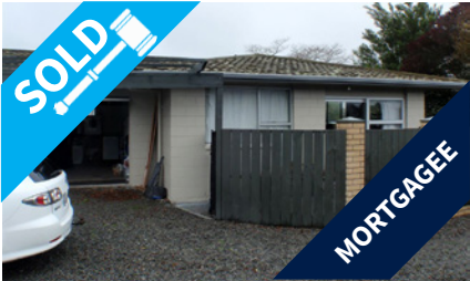
16 Bidwell Street, HILLMORTON $75,500