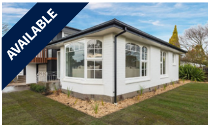
1/484 Ilam Road, ILAM