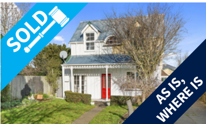
183 Beach Road, NORTH NEW BRIGHTON $200,000