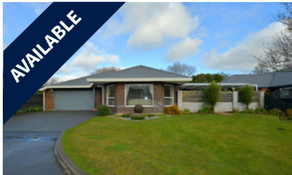
15 Thoresby Mews, AVONHEAD