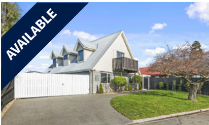
4 Chokebore Place, UPPER RICCARTON