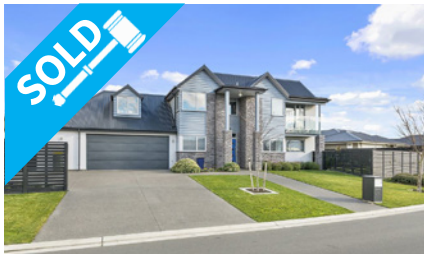
11 Sterling Drive, PREBBLETON $915,000