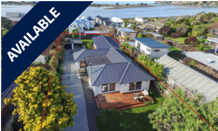
26 Celia Street, REDCLIFFS