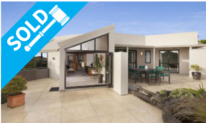
4 Peninsula View, SCARBOROUGH $750,000