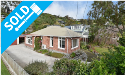
43 Augusta Street, REDCLIFFS $507,000