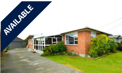
52 Dunster Street, BURNSIDE