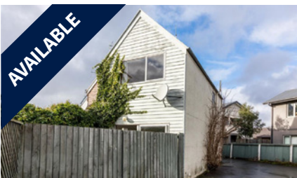
5/17 Percy Street, PHILLIPSTOWN