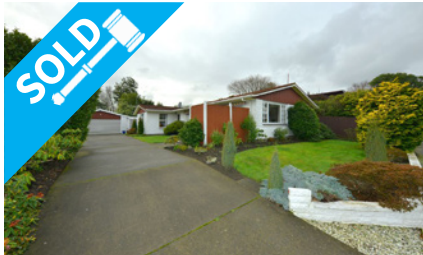
14 Rosedale Place, AVONHEAD $500,000