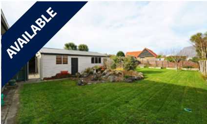
24 Farquhars Road, REDWOOD