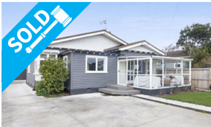
74 Cobham Street, SPREYDON $448,000