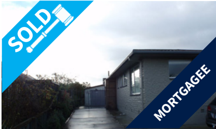
26 Bidwell Street, HILLMORTON $40,000