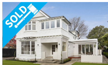
102 Heaton Street, MERIVALE $1,450,000