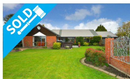
269 Sawyers Arms Road, HAREWOOD $670,000