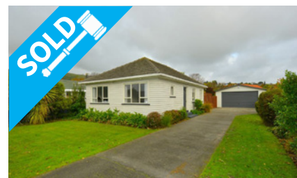
264 Opawa Road, HILLSBOROUGH $365,000