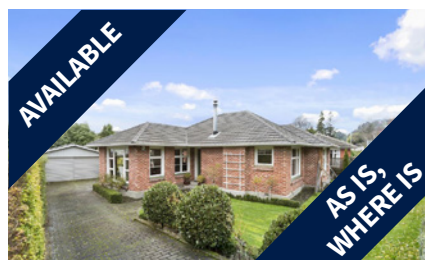
19 Centaurus Road, CASHMERE