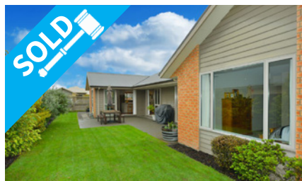
25 Cridland Place, HALSWELL $665,000