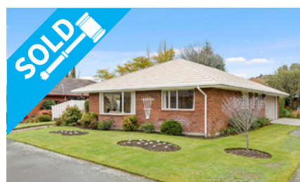
6 Castle Way, BECKENHAM $545,000