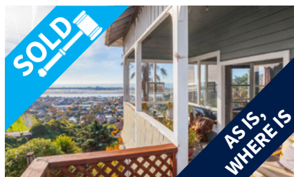
54 Augusta Street, REDCLIFFS $506,000