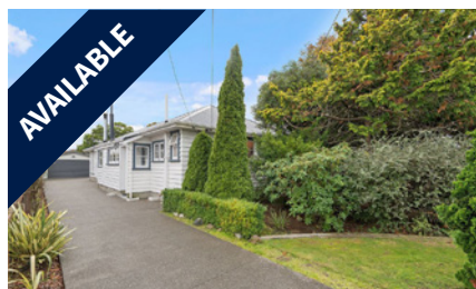
13 Kellys Road, MAIREHAU