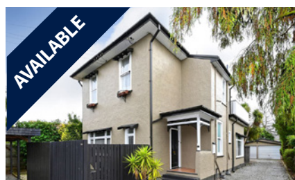
39 Edinburgh Street, SPREYDON