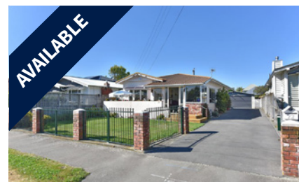
72 Cornwall Street, ST ALBANS