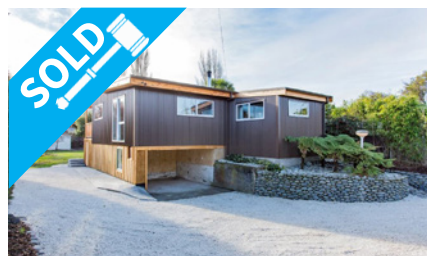
16 Queens Avenue, WAIKUKU BEACH $415,000