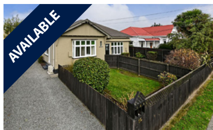
16 Crohane Place, ADDINGTON