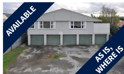
1-5/89 Sherborne Street, ST ALBANS