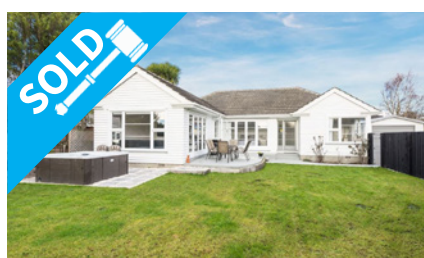
11 Kyeburn Place, AVONHEAD $486,500