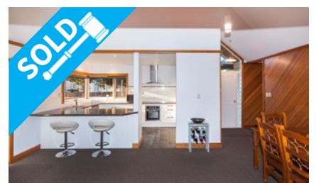
239B Westminster Street, ST ALBANS $451,000