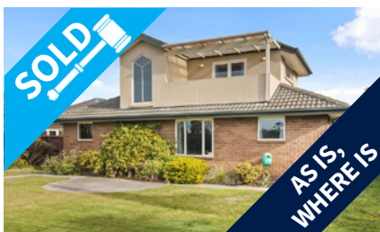
61 Forest Drive, PARKLANDS $350,000