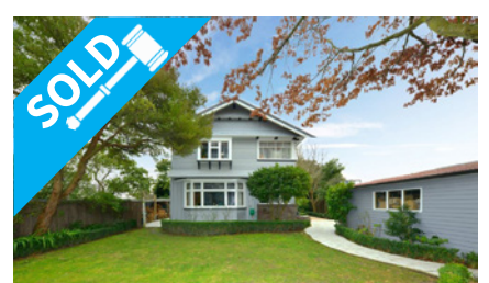
147 Rose Street, CASHMERE $732,000