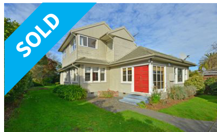
254 Ilam Road, BURNSIDE No Price