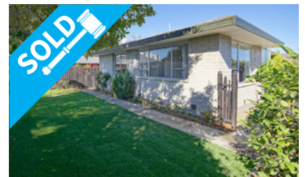
2/19 Boon Street, SYDENHAM $410,000