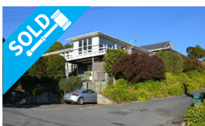
42 Selwyn Avenue, AKAROA No Price