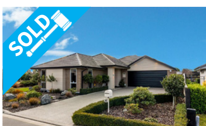
30 Brookwater Avenue, NORTHWOOD $871,000