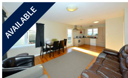
1/25 Owens Terrace, UPPER RICcarton