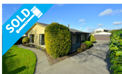
38 Veitches Road, CASEBROOK $395,000