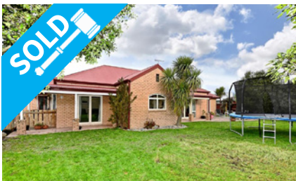
49 Ti Rakau Drive, FERRYMEAD $314,168