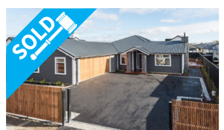
219 Highsted Road, CASEBROOK $920,000