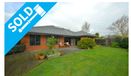
67 Kotuku Crescent, FERRYMEAD $446,000