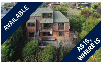
12 Sedgwick Way, WESTMORLAND