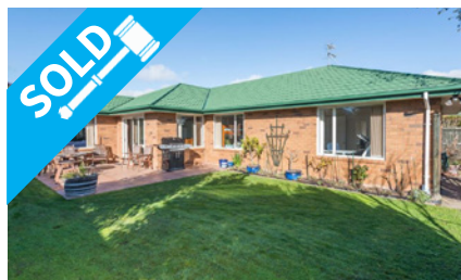
5 Fantail Lane, FERRYMEAD $431,000