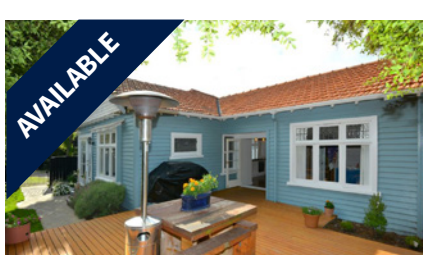
81 Forfar Street, ST ALBANS