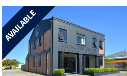
9 Hamilton Street, HOKITIKA