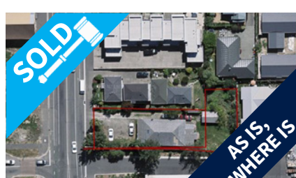
304 Stanmore Road, RICHMOND $390,000