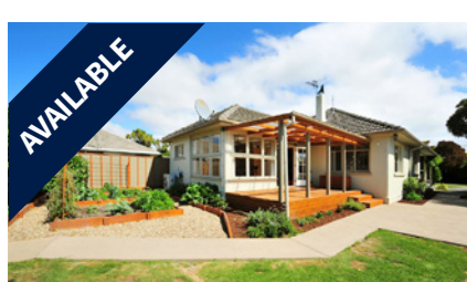
403 Halswell Road, HALSWELL