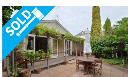
16 Sumnervale Drive, SUMNER $428,000