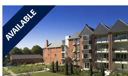
11/142 Park Terrace, CHCH CENTRAL