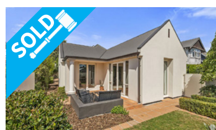
69 Murray Place, MERIVALE $730,000