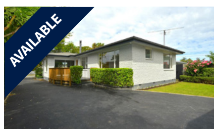
3 Newmark Street, BISHOPDALE