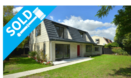
1/74 Jeffreys Road, FENDALTON $507,500