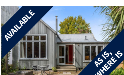
171 Chester Street East, CHCH CENTRAL