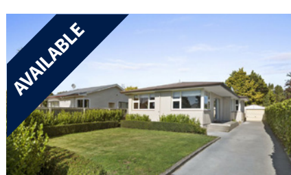
133 Lyttelton Street, SPREYDON