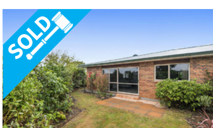
11b Deloraine Street, SOMERFIELD $395,000