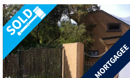
15 Monalua Avenue, PURAU $255,000