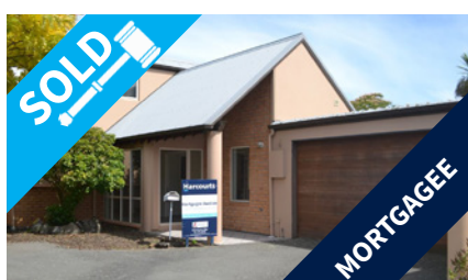
5 Royal Elm Lane, BRYNDWR $460,000