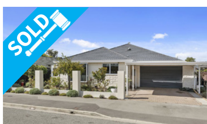
98 Picton Avenue, RICcarton $512,000