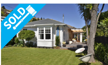
86 Wiggins Street, SUMNER $770,000