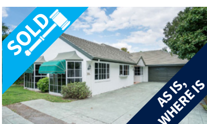
30a Queens Avenue, FENDALTON $670,000