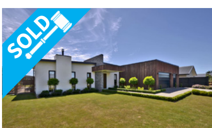
11 Royston Common, WEST MELTON $945,000