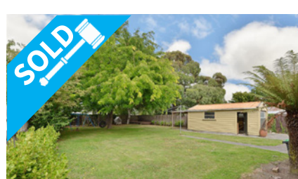
34 Moreland Avenue, PAPANUI $410,000