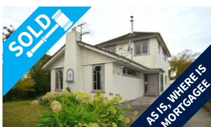
292 Hills Road, SHIRLEY $265,000