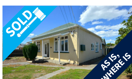
58 Patten Street, AVONside $195,000