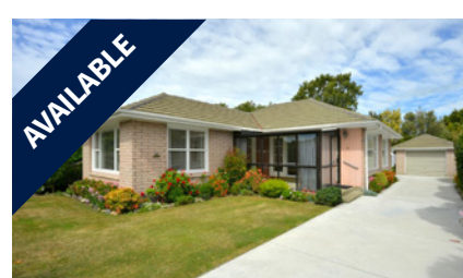
16 Lochee Road, RICcarton