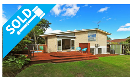
6 Hillcrest Place, Avonhead $600,000