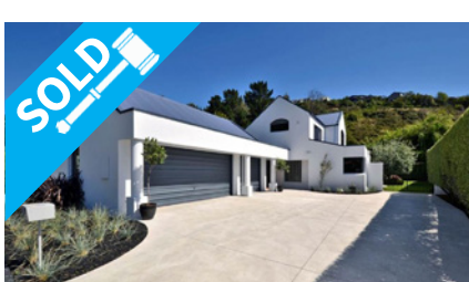
8 Basil Place, REDCLIFFS $857,500