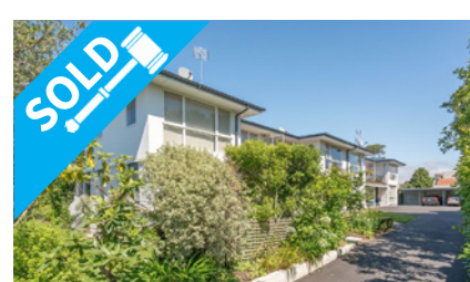
3 Repton Street, MERIVALE $2,500,000