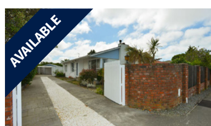
3 Staffordshire Street, BURWOOD