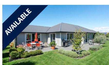
17 Adams Street, KAIAPOI