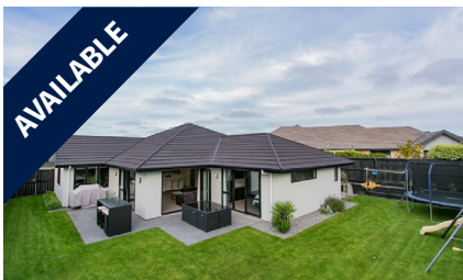
59 Eastwood Rise, WAIMAIRI BEACH