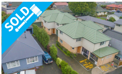
95A Matipo Street, RICCARTON $649,000