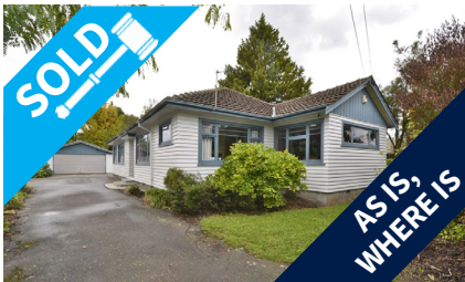
59 Mackenzie Avenue, WOOLSTON $279,000