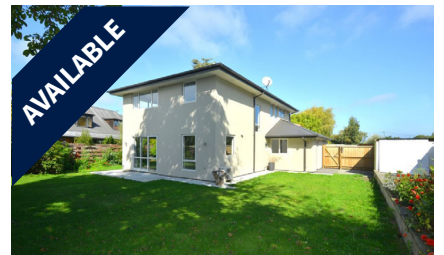
59C Sturrocks Road, REDWOOD