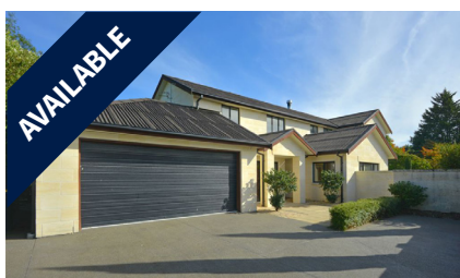
4 Stableford Green, BURNSIDE