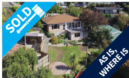
190A Mt Pleasant Road, MT PLEASANT $364,000