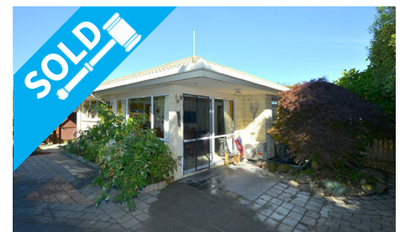
2A/26 Wittys Road, AVONHEAD $398,000