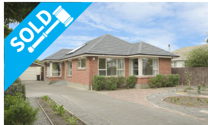
440 Wairakei Road, BURNSIDE $450,000