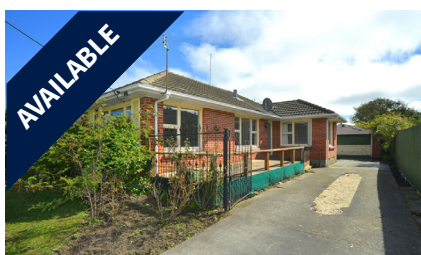
40 Greenhurst Street, SOCKBURN