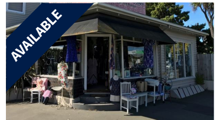
2 Smith Street, WOOLSTON