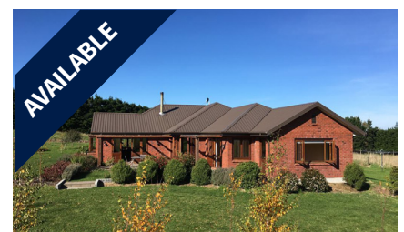
20 Crallans Drain Road, OXFORD