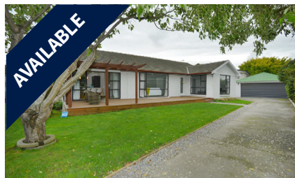
263 Waimairi Road, ILAM