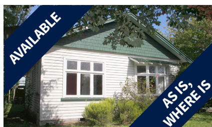
1/11 Wairakei Road, STROWAN