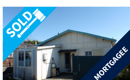
2/93 Tedder Street, NORTH NEW BRIGHTON $101,000