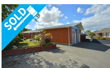
10 Greendale Avenue, Avonhead $530,000