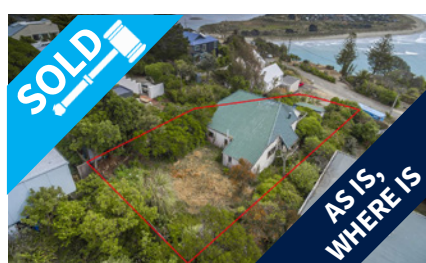
5 Kinsey Terrace, SUMNER $405,000