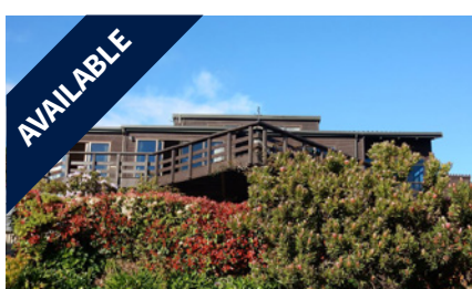
6 Cecil Wood Way, SUMNER