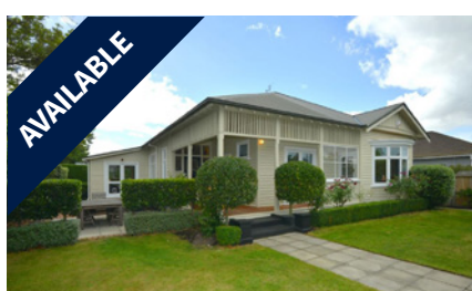
14 Roosevelt Avenue, ST ALBANS