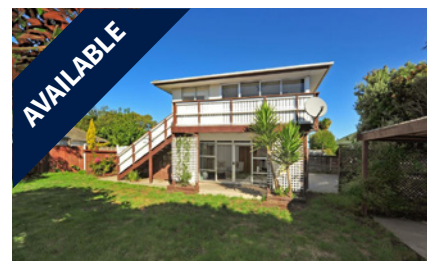
462 Main South Road, HORNBY