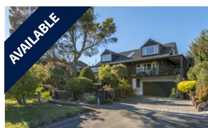
5 Cumbria Lane, WESTMORLAND