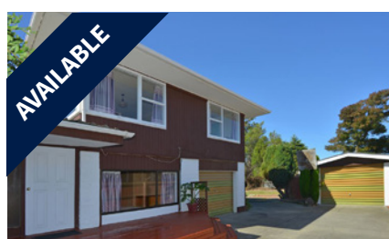
7 Abbotts Place, AVONHEAD