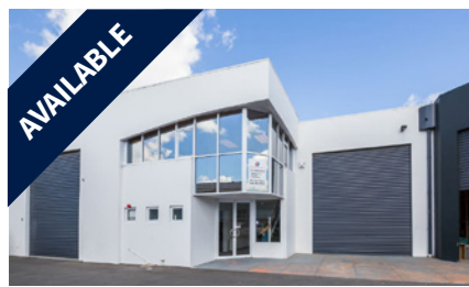
2/330 St Asaph Street, CHCH CENTRAL