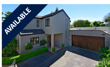
2/16 Hanover Place, ILAM