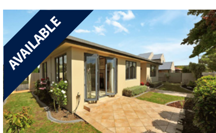
90 Jeffreys Road, FENDALTON