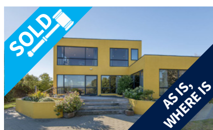
60 Ravensdale Rise, WESTMORLAND $446,000