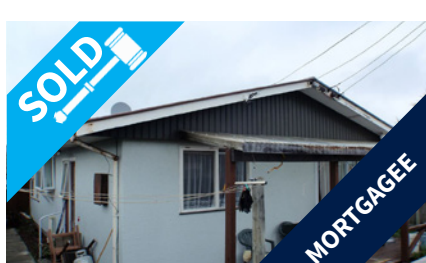
1/93 Tedder Street, NORTH NEW BRIGHTON $135,000