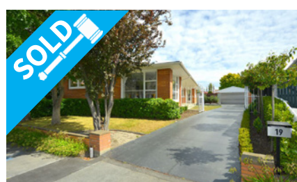
19 Delaware Crescent, RUSSLEY $530,000