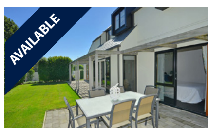
7 Holderness Place, ILAM