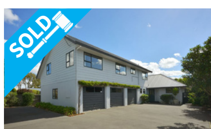
53A Neville Street, SPREYDON $595,000