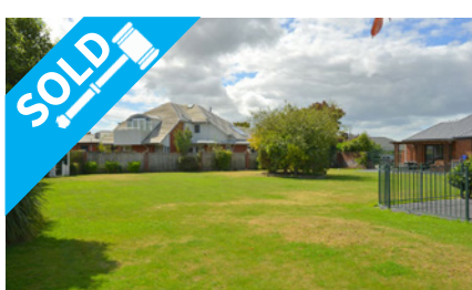
10 Thoresby Mews, AVONHEAD $541,000