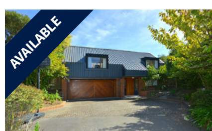
35 Rembrandt Place, BURNSIDE