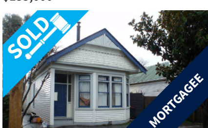
143 Ensors Road, WALTHAM $195,000