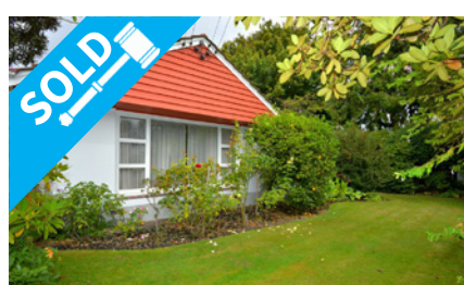
48 Helmores Lane, FENDALTON $1,090,000