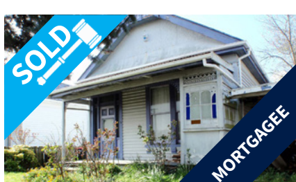
155 Huxley Street, SYDENHAM $240,000