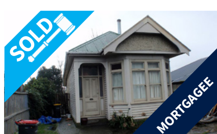
145 Ensors Road, WALTHAM $165,000