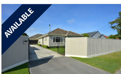
44 Ranger Street, MAIREHAU