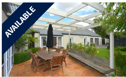
8 Priorsford Court, AVONHEAD