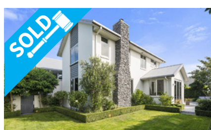
21 Applefield Court, NORTHWOOD $1,130,000