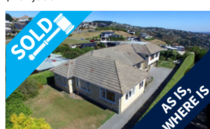
126 Huntsbury Avenue, HUNTSBURY $345,000