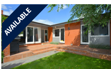
20 Toorak Avenue, AVONHEAD