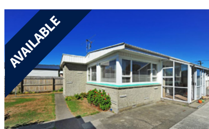
2/23 Prestons Road, REDWOOD