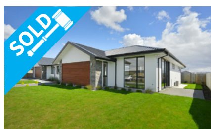
4 Milano Lane, WIGRAM $845,000