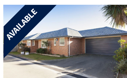
125D Tancred Street, LINWOOD