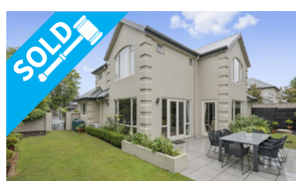
3 Gleneagles Terrace, FENDALTON $765,000