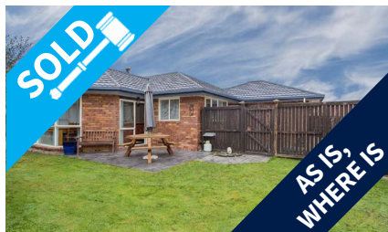
99 Ti Rakau Drive, FERRYMEAD $260,000