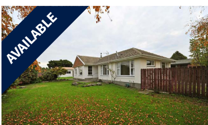
3 Geelong Place, BURNSIDE