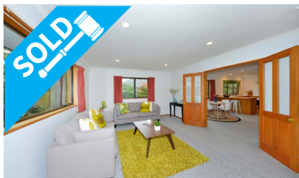
16A Shaftesbury Street, AVONHEAD $470,000