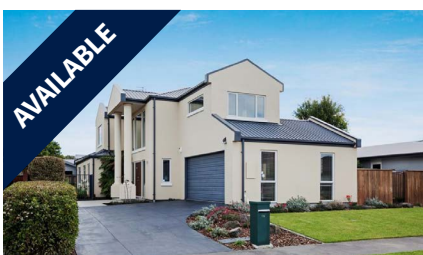
25 Brookfield Drive, NORTHWOOD