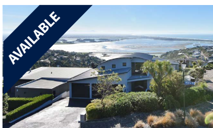
2 Avery Place, REDCLIFFS