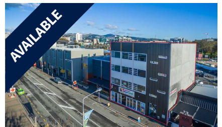
65-67 Victoria Street, CHCH CENTRAL