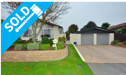
85 Cheyenne Street, UPPER RICCARTON $575,000