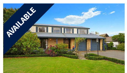
9 Swithland Place, AVONHEAD