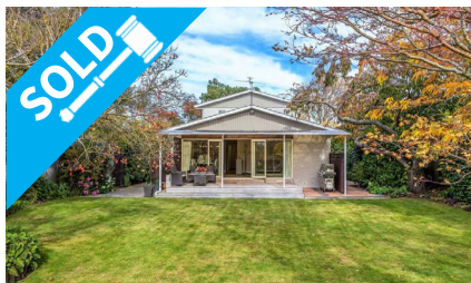
133 Avonhead Road, AVONHEAD $839,000