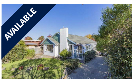
11 Ansonby Street, AVONHEAD