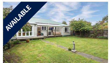
62 Opawa Road, OPAWA