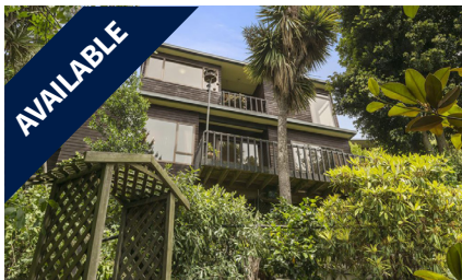
8 Huntlywood Terrace, HILLSBOROUGH