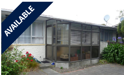
2/100 Brougham Street, ADDINGTON