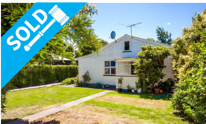
71 Condell Avenue, PAPANUI $430,000