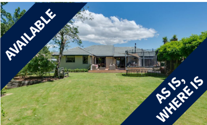
20a & 20b Ensors Road, OPAWA