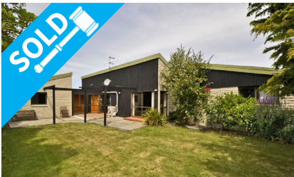
19 Dunbarton Street, REDWOOD $475,000