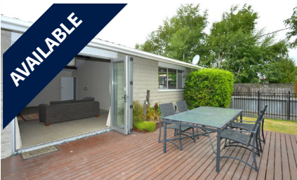
36 Craven Street, UPPER RICcarton