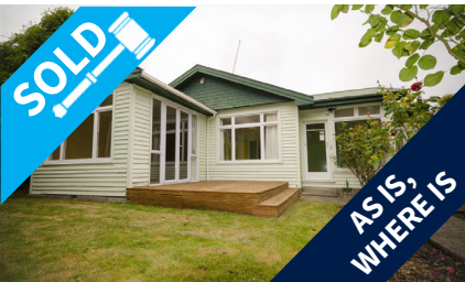
1 Clarendon Terrace, WOOLSTON $180,000