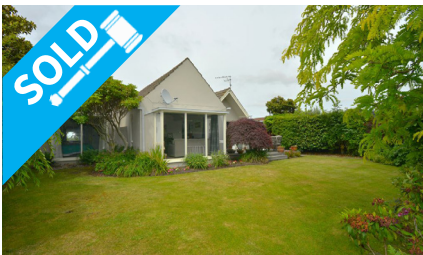
19b Deepdale Street, BURNSIDE $655,000