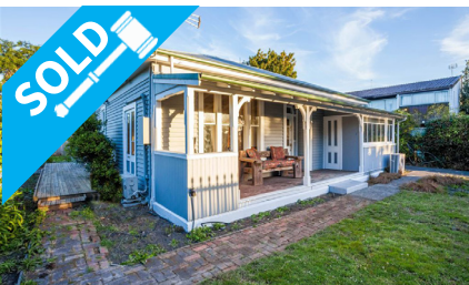
208 Fitzgerald Avenue, CHCH CENTRAL $395,000