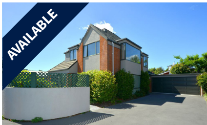
15a Coniston Avenue, ILAM