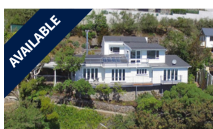
3 Flowers Track, SUMNER