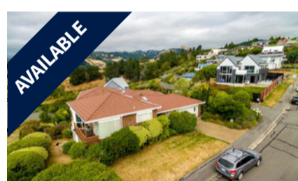
65 Ravensdale Rise, WESTMORLAND