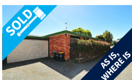
3A & B Claridges Road, HAREWOOD $470,000