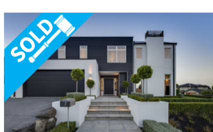
2 Rushden Rise, WESTMORLAND $1,130,000