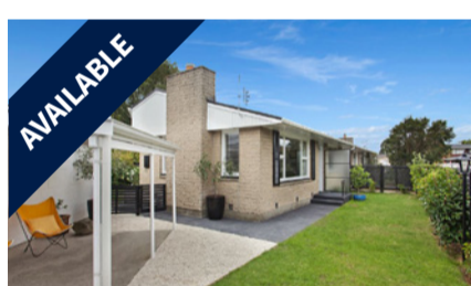
1 Ketton Place, ST ALBANS