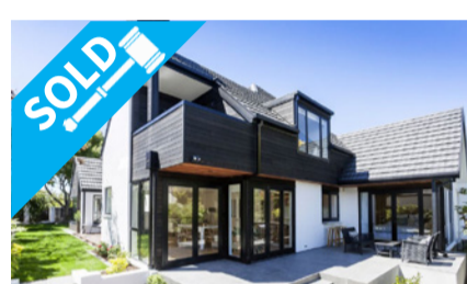
117 St Andrews Square, STROWAN $1,610,000