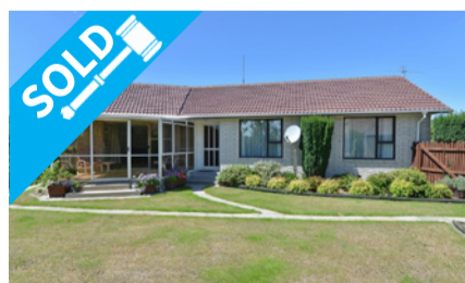
39 Gibson Drive, HORNBY $456,000