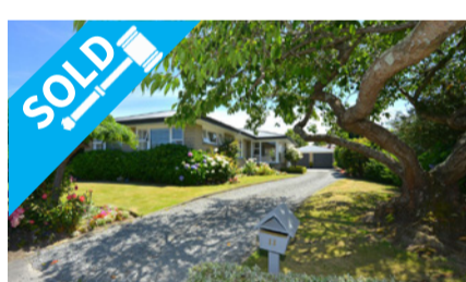
11 Oakfield Street, BURNSIDE $620,000