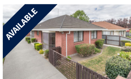
1/28 Strickland Street, SYDENHAM