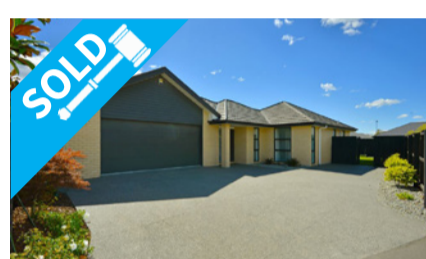
41 Sioux Avenue, WIGRAM $712,000