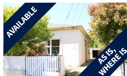
12 King Street, SYDENHAM