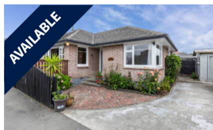
53 Neville Street, SPREYDON