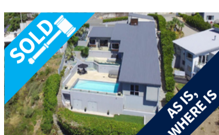
10 Mandalay Lane, REDCLIFFS $575,000