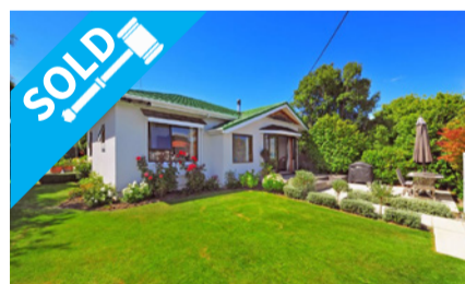
90 Birdwood Avenue, BECKENHAM $521,000