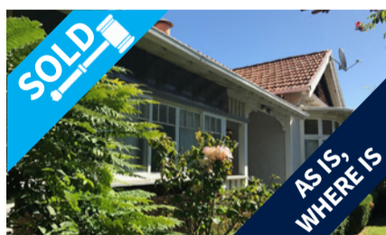
555 Manchester Street, ST ALBANS No Price