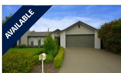
49 Springwater Avenue, NORTHWOOD