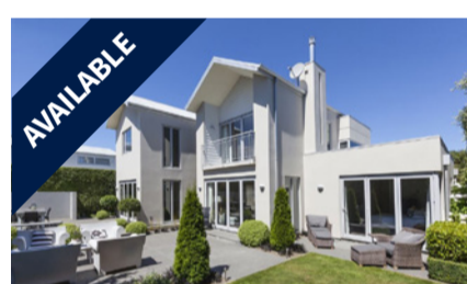
1 Church Lane, MERIVALE