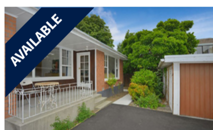
3/43 Rhodes Street, MERIVALE