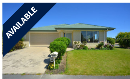
15a Hurricane Way, WIGRAM