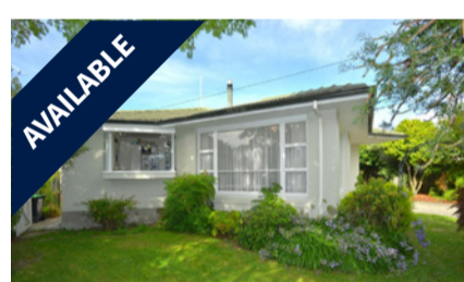
3 Sandringham Place, BURNSIDE