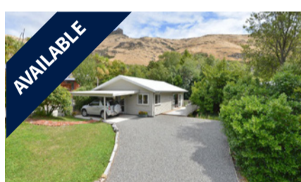
9 Port Hills Road, HEATHCOTE