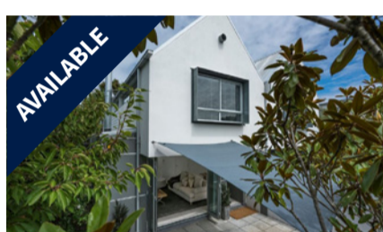
60 Clare Road, MERIVALE