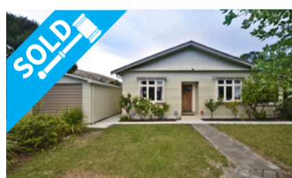
32 Dryden Street, SUMNER $630,000