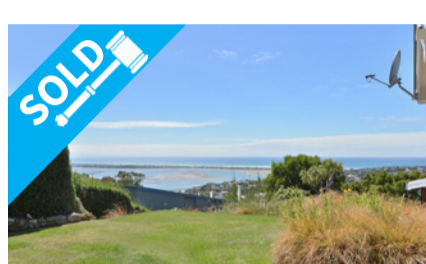
2/182 Mt Pleasant Road, MT PLEASANT $342,000