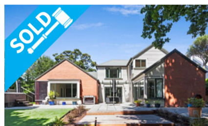
42a Kotare Street, FENDALTON $1,100,000